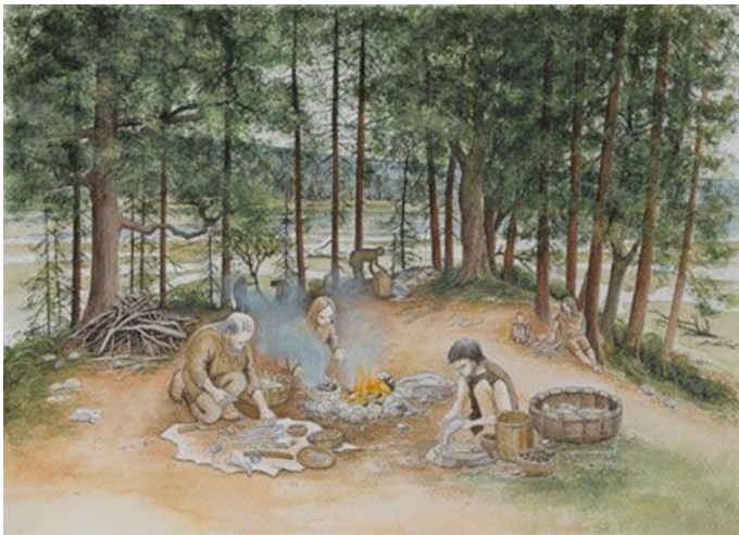
Plate 1 Hunter gathers living close to woodland and river, reflecting their need for resources such as wood, plants, fish and fowl