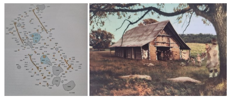
Figure 2 To the left, a plan of the Neolithic Hall recorded at White Horse Wood with an artist's reconstruction on the right (c/o Oxford Archaeology)

There is also evidence for larger structures. Excavations carried out during the construction of the CTRL rail line recorded a large rectangular building located close to the White Horse Woods just north of Bluebell Hill. Measuring approximately 17.5m in length and 7m in width this structure consisted of 6 rows of postholes traversed by a further 10 rows of postholes, with flanking gullies and later porches. This building is not in isolation either as there are reports of a second similar building recorded directly south adjacent to the Pilgrims Way.