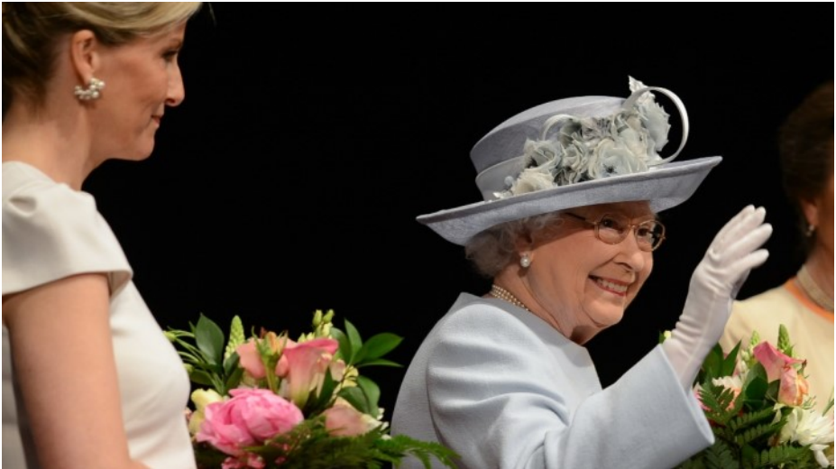
Her Majesty Queen Elizabeth II at the National WI AGM in The Albert Hall in 2015

We thank her for her dedication, service and fellowship. Many of our members have fond memories of her and will treasure these for years to come. Her Majesty's commitment to duty and her devotion to a life of service was an inspiration to us all.