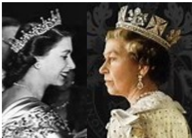
Queen Elizabeth II 1926 — 2022

Published by the Church of England Parish of Burham & Wouldham. Produced and delivered by local volunteers.